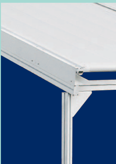
Coverboard and coupling plate