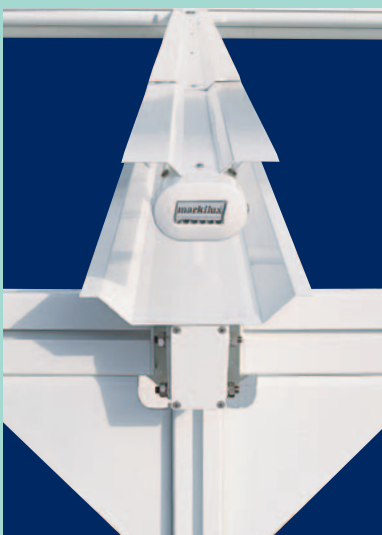
Coupled awning with top and bottom coverboards