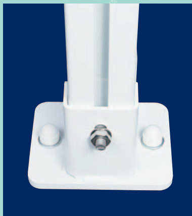
Foot plate with upright inserted