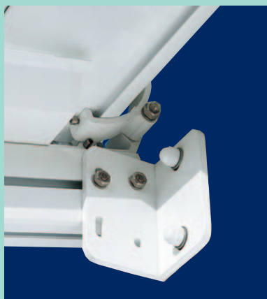
Wall fixture up to an angle of 30° is possible